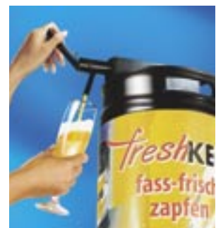
Self-sufficient dispensing system – any time, any place