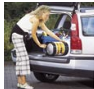
Lightweight and innovative design guarantees easy transport