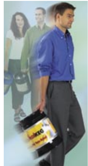
Ergonomically moulded handles guarantee optimal handling

freshKEG: the best investment for increasing your sales and market shares.